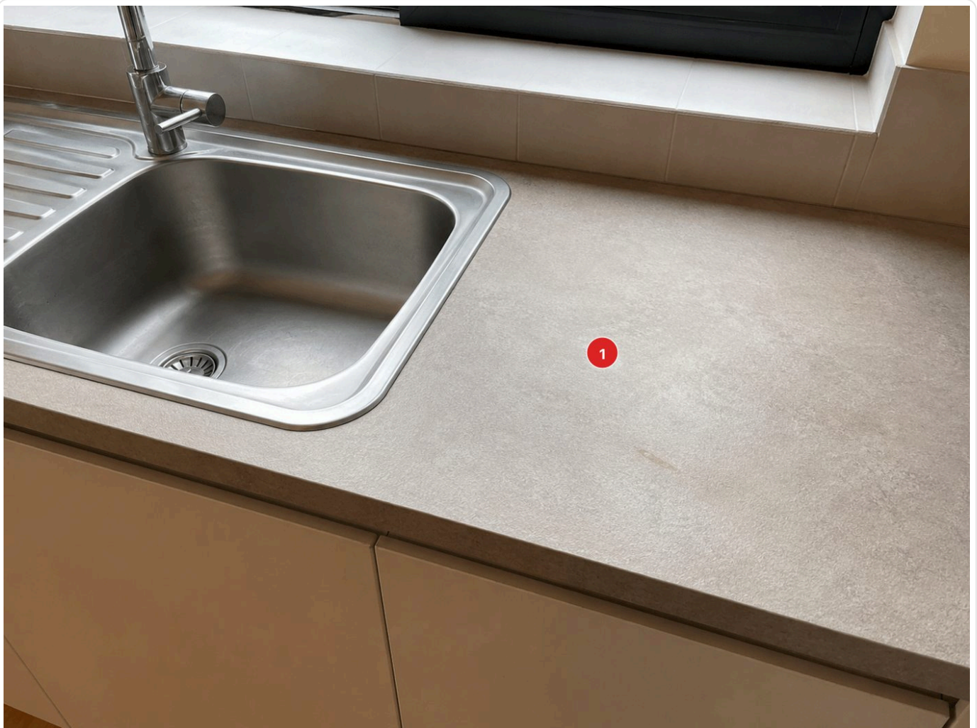
Zoomed detail 1